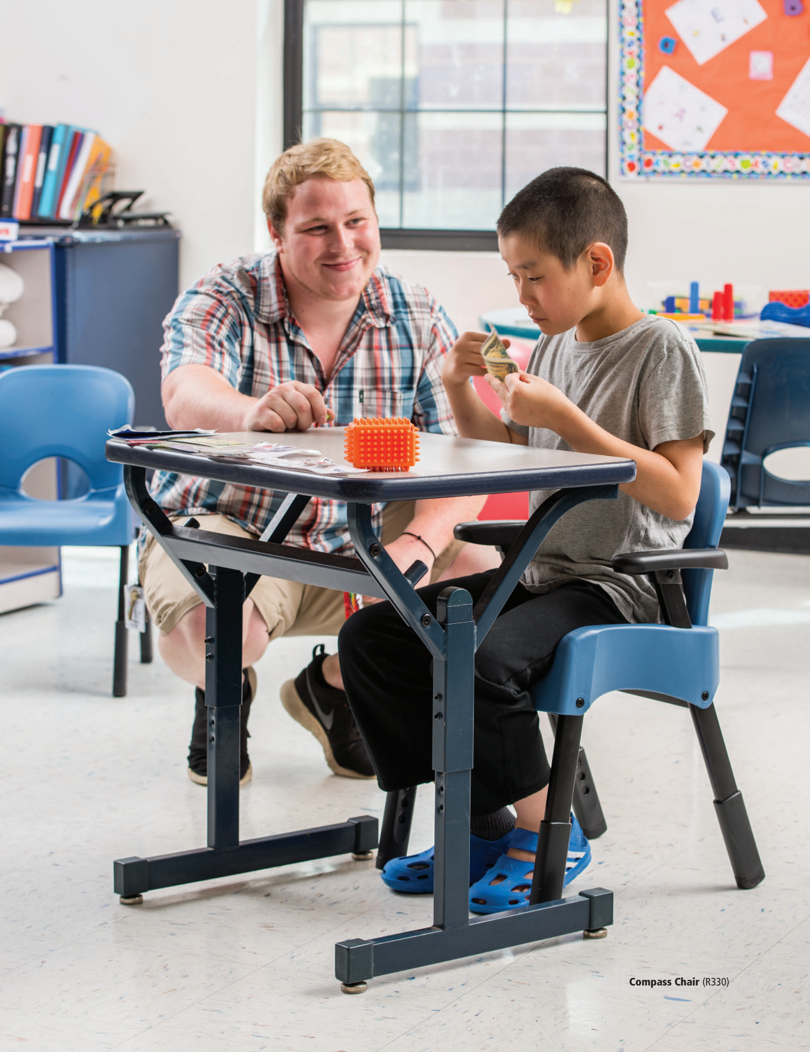
Compass Chair (R330)