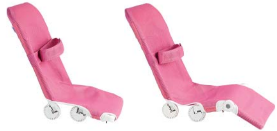
Without calf rest (Z269)